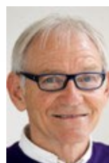
Jørn Grønkjær Denmark